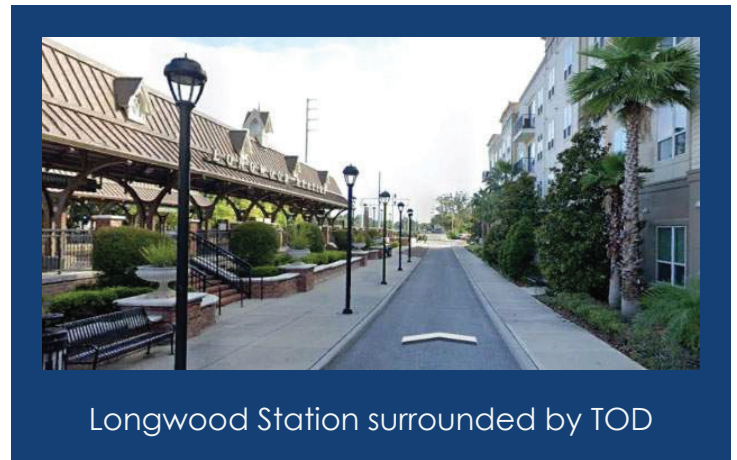
Longwood Station surrounded by TOD