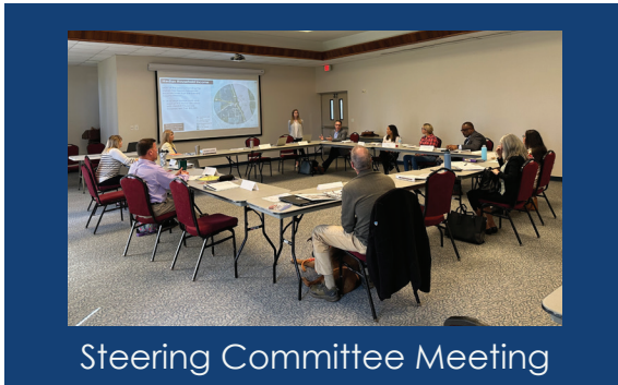
Steering Committee Meeting