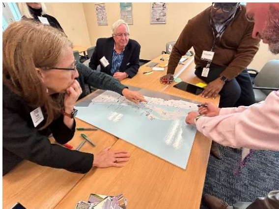
Figure 4. Breakout Session Destinations Map Exercise