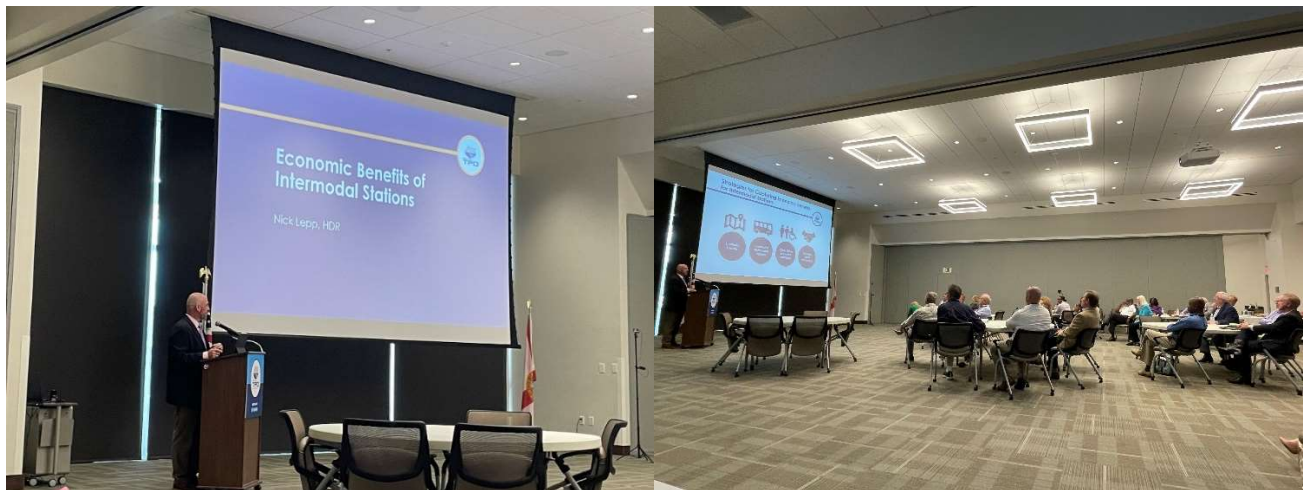
Figure 1. Building Partnerships Presentations