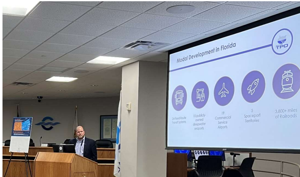
Figure 2. Keynote Presentation

A question was asked regarding subsidies available. Mr. Thoburn replied that the grants won't fund operations but can fund capital projects. One example is the federal CRISI (Consolidated Rail Infrastructure and Safety Improvements) grant program for inner city rail.