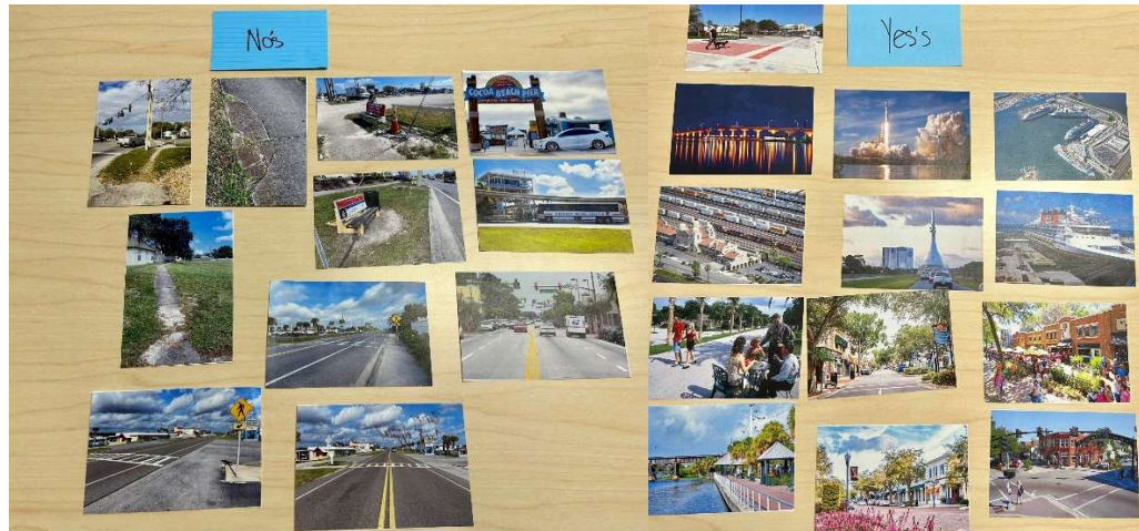
Figure 3. Breakout Session Visioning Board Examples