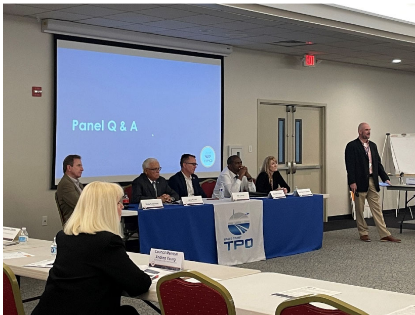
Figure 2. Modal Panel Q & A