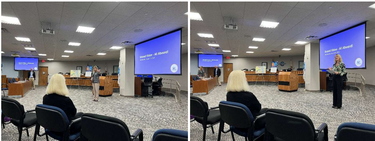
Figure 1. Meeting Welcome